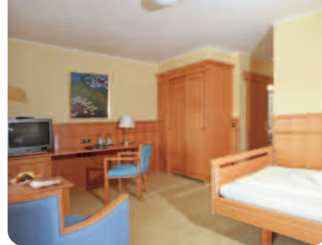
First class patient room